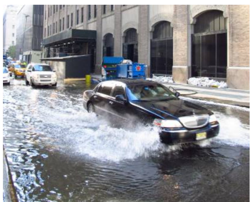
Fig. 4. Barclay Street flooded from water being pump out of Verizon's central office at 140 West Street.