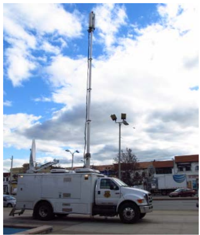
Fig. 24. Two COLTs in Long Beach. The one in the back is still being installed.