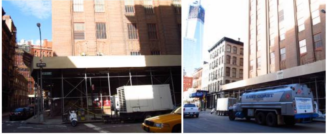
Fig. 31. Two views of the 60 Hudson Street data center showing additional small gensets in the area and a truck with diesel to replenish the fuel tanks at this site.