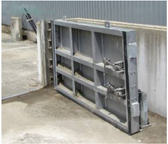
Fig. 14. Flood gate in Unosumai central office, Japan.