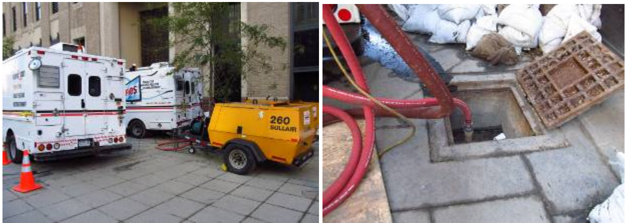
Fig. 6. Emergency cable pressurization units at 140 West Street. The image on the right shows the pressurized air injection nozzle.