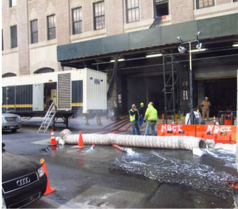
Fig. 3. Water being pumped out and a diesel generator running at the entrance on Barclay Street for Verizon's main central office in Manhattan.

Fig. 2. Water being pump out through the main entrance of Verizon's central office at 140 West Street.