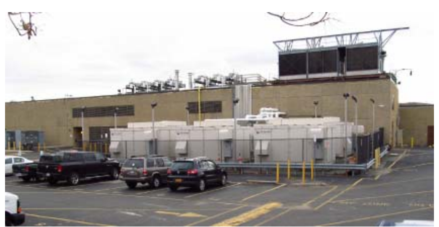
Fig. 16. Fuel cells at Verizon's central office in Garden City.