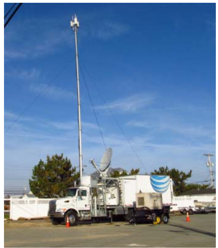
Fig. 23. A COLT near Seasigh Heights, NJ.