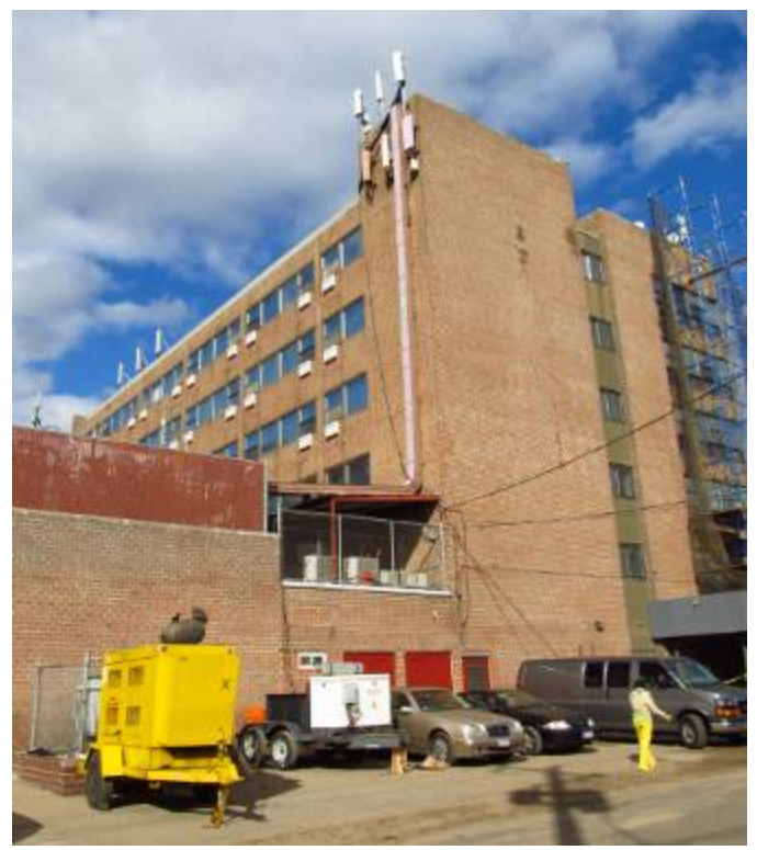
Fig. 19. A rooftop cell site in the Rockaway Peninsula.