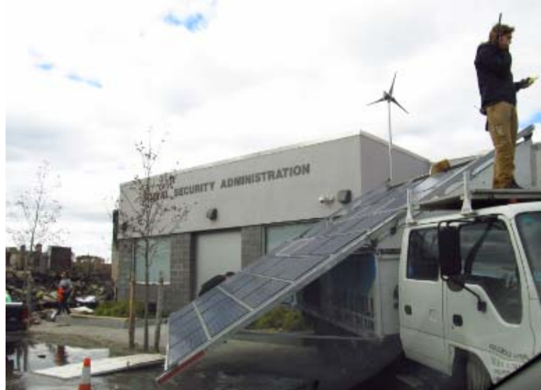
Fig. 17. A person talking on a satellite phone standing on top of a truck with solar panels to provide electricity to people in the Rockaway Peninsula.