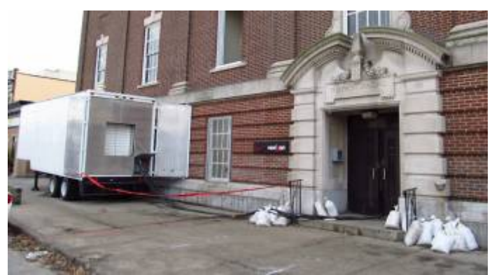
Fig. 11. Verizon's central office in Long Beach.

Fig. 10. Another view of Verizon's central office at Rockaway Beach showing a large portable genset behind the waste liquids vacuum pump.