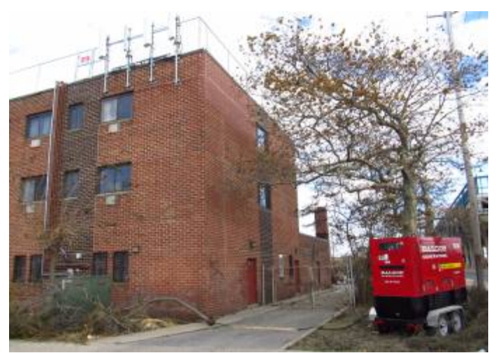
Fig. 20. Another cell site in the Rockaway Peninsula