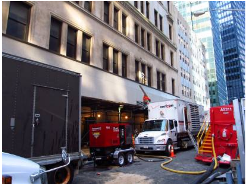
Fig. 7 Pearl Street side of Verizon's central office at 104 Broad Street.