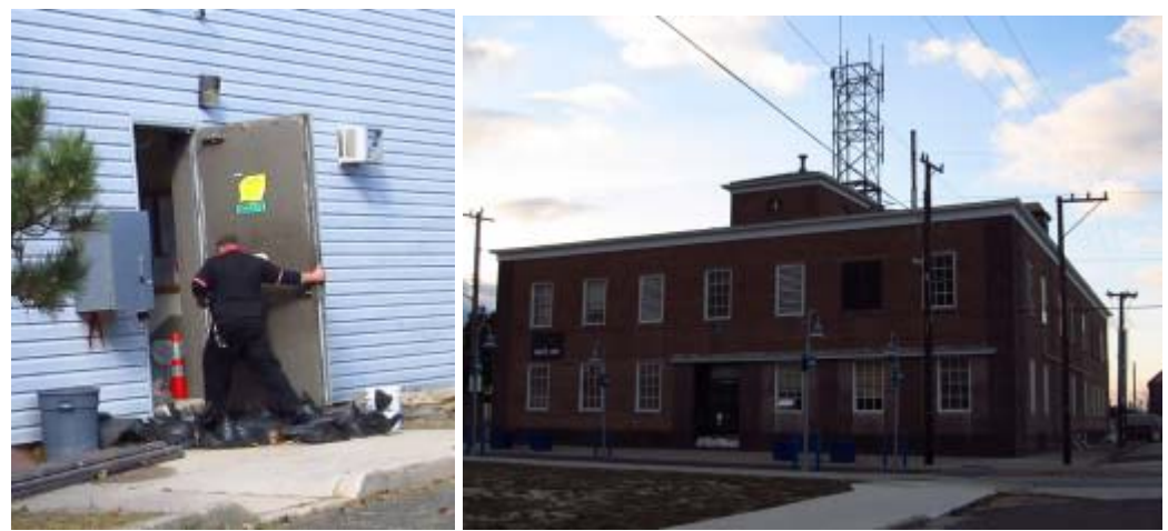
Fig. 15. Verizon's central offices in Brigantine (Left) and Wildwood (Right). Notice in both cases the sandbags at the doors.