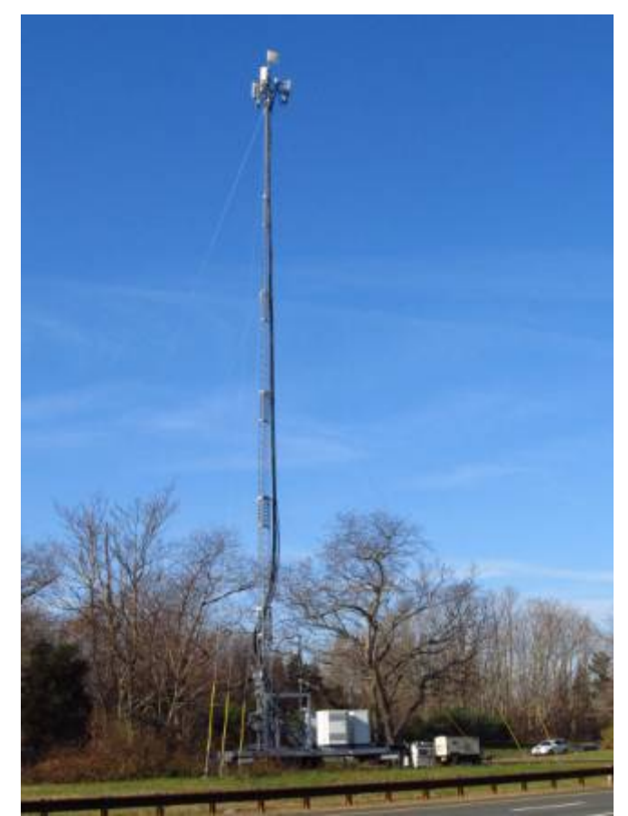
Fig. 25 A COW along the Garden State Parkway.