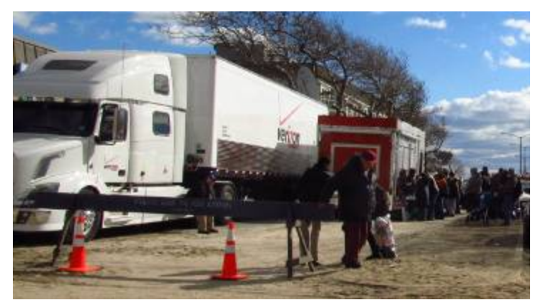
Fig. 27. An emergency communications truck in Rockaway Peninsula