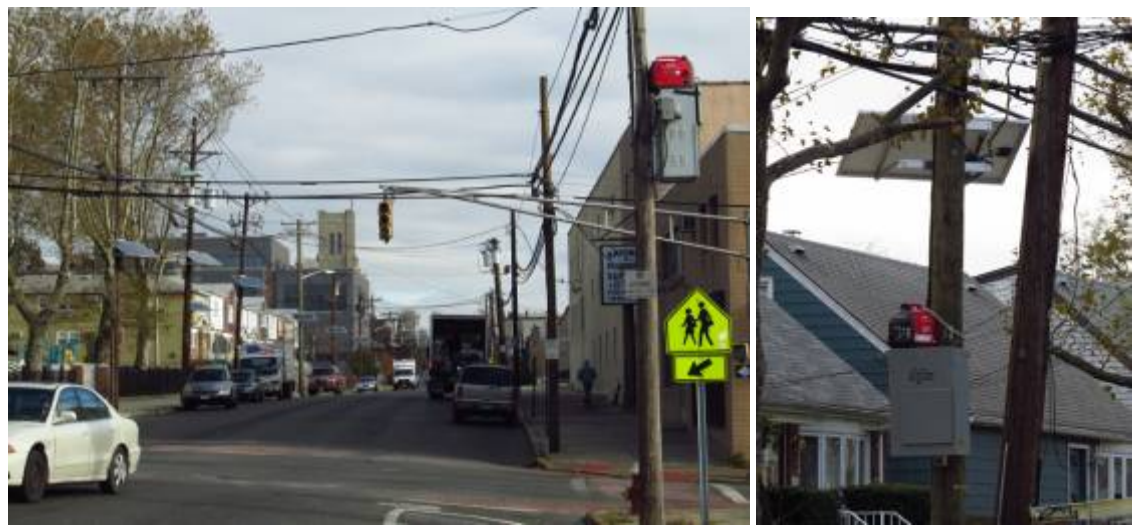
Fig. 28. CATV equipment in Bayonne, NJ.