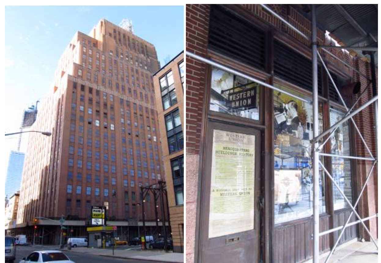
Fig. 30. Data center at 60 Hudson Street. Notice the dielsel generator exhaust on the photo on the right.