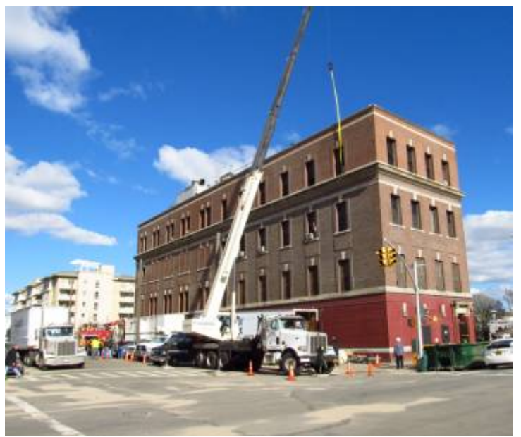
Fig. 9. Verizon's central office at Rockaway Beach.