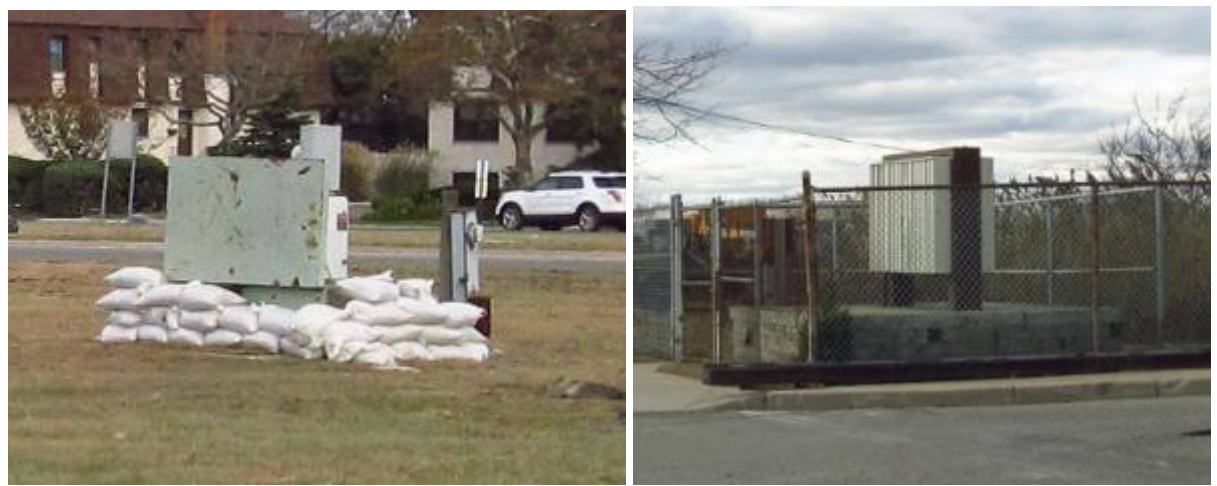
Fig. 32. A vault (left) and a DLC RT cabinet (right) in the Rockaway Peninsula.