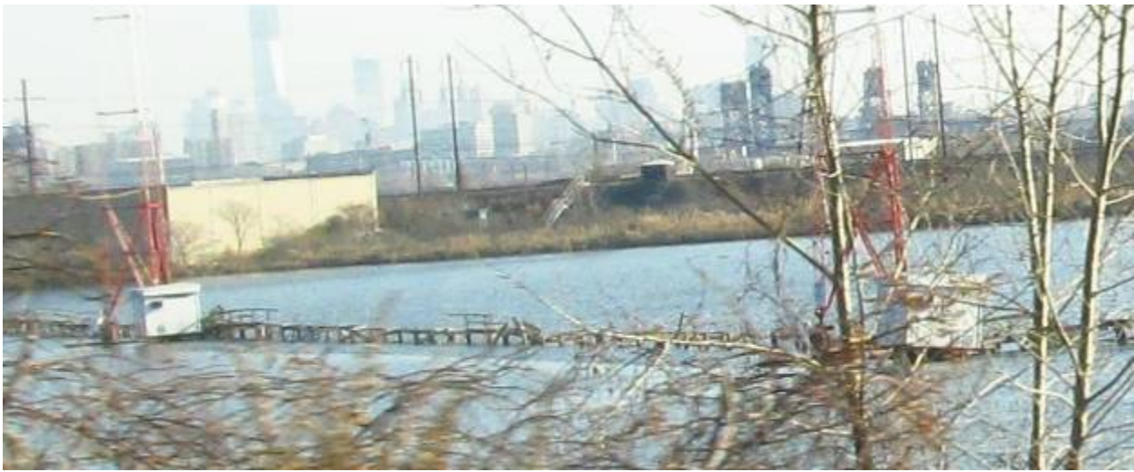
Fig. 39. Transmission towers for WEPN, damaged by Sandy.