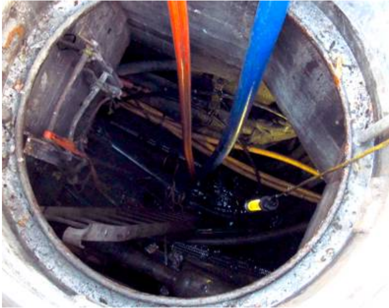
Fig. 35. A manhole still with water.