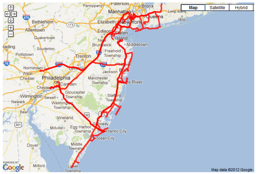
Fig. 1. Damage assessments tracks. Background map: © Google

A. Kwasinski, "Effects of Notable Natural Disasters from 2005 to 2011 on Telecommunications Infrastructure: Lessons from On-Site Damage Assessments," INTELEC 2011, 9 pages, Amsterdam, Netherlands, October, 2011. A. Kwasinski, "U.S. Gulf Coast Telecommunications Power Infrastructure Evolution since Hurricane Katrina," International Telecommunication Energy Special Conference, 2009, 6 pages, Vienna, Austria, May 10-13, 2009.