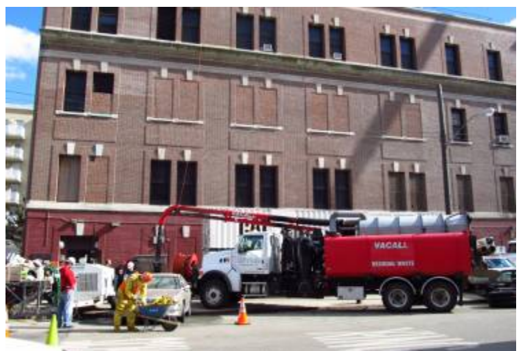
Fig. 10. Another view of Verizon's central office at Rockaway Beach showing a large portable genset behind the waste liquids vacuum pump.