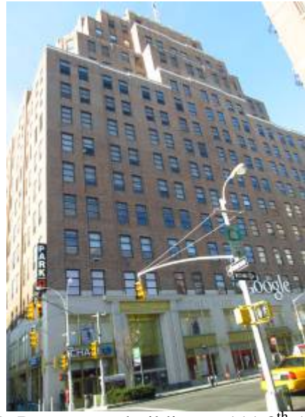
Fig. 29. Data center building at 111 8<sup>th</sup> Avenue.