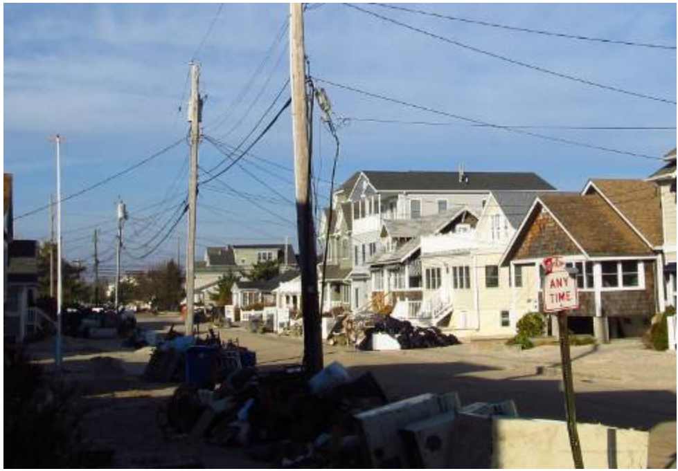
Fig. 37. Damage to the pole nearest the sea in Ortley Beach