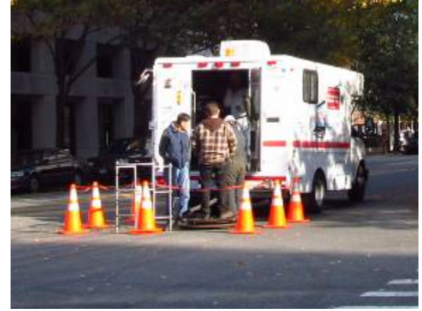
Fig. 34. A Verizon's truck working next to manhole.