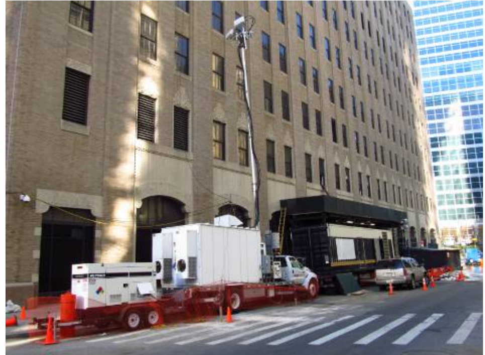
Fig. 5, Another view of Barclay Street showing a COLT parked next to Verizon's central office at 140 West Street.