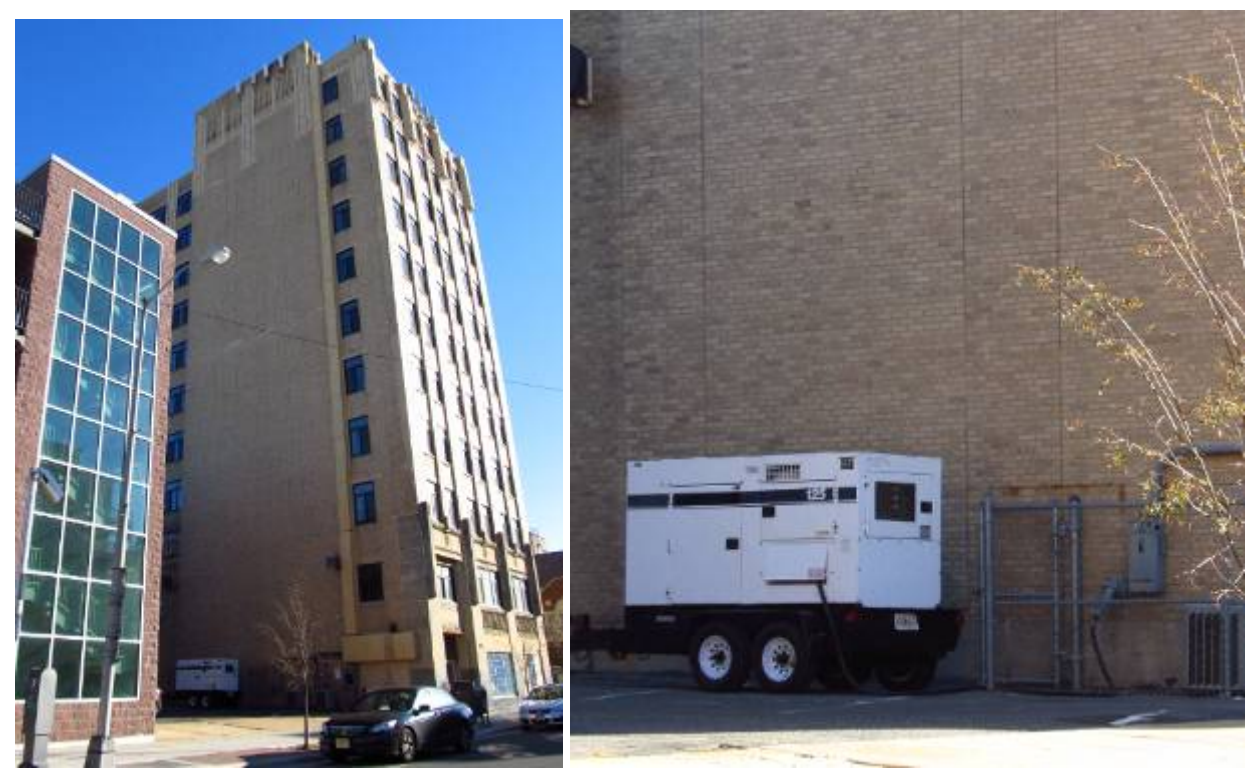
Fig. 18 A rooftop cell site in Ausbury Park powered by a genset at street level. Notice the standard connector for the genset.