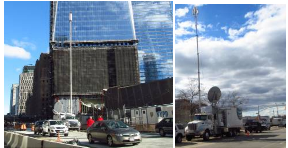
Fig. 22. A COLT in front of the Freedom Tower in New York City (Left) and a Colt in the Rockaway Peninsula.