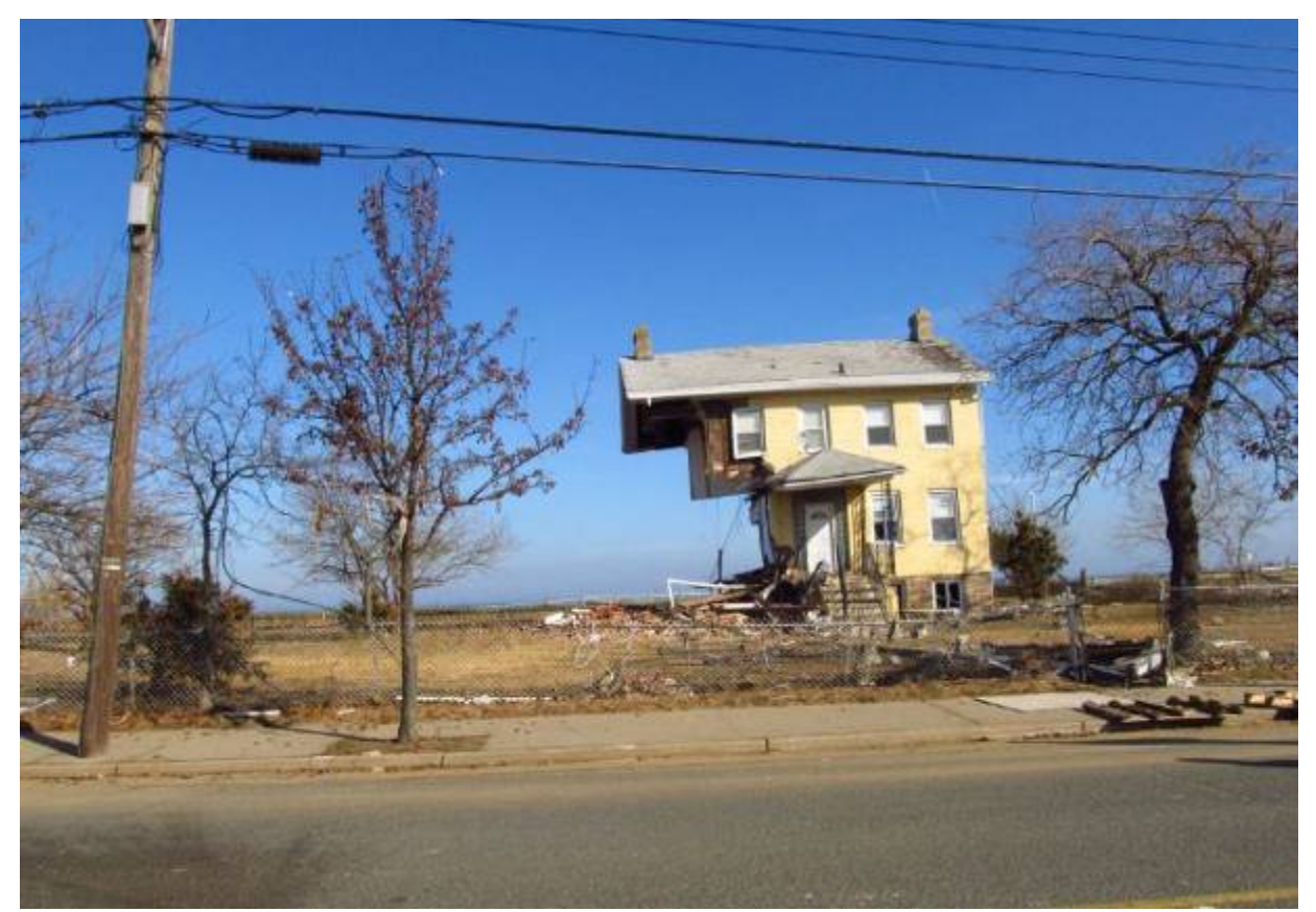
Fig. 38. Important damage to dwellings in Union Beach but little damage to poles.