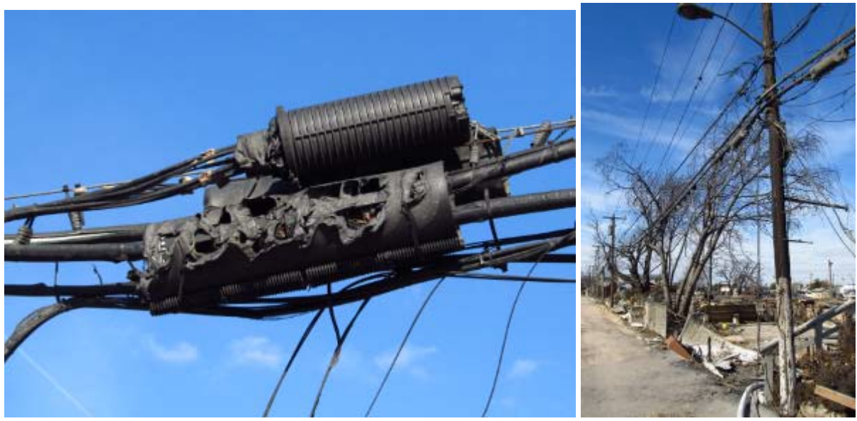
Fig. 33. Damage from a fire affecting communications infrastructure.