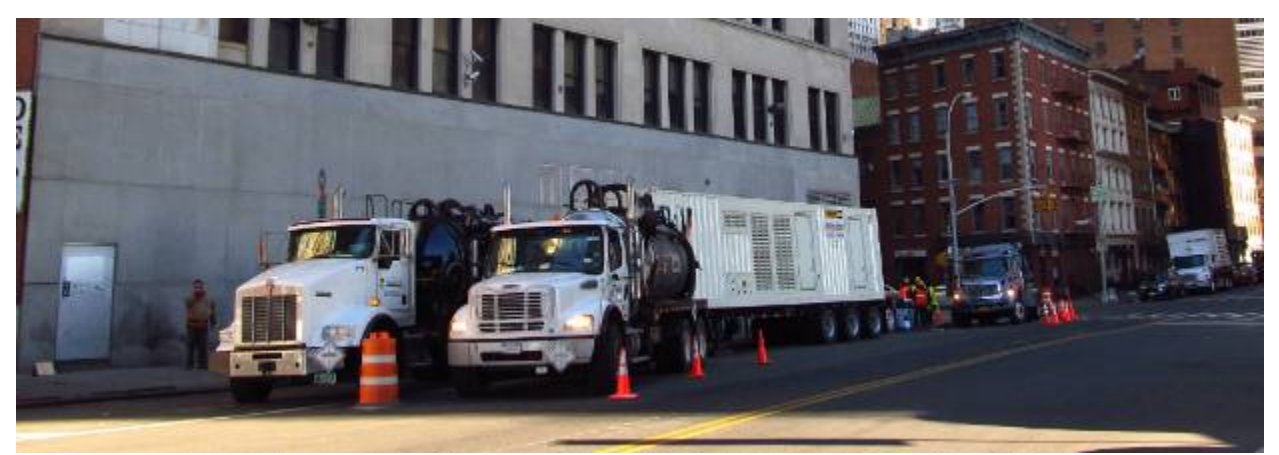
Fig. 8. Water Street side of Verizon's central office at 104 Broad Street.