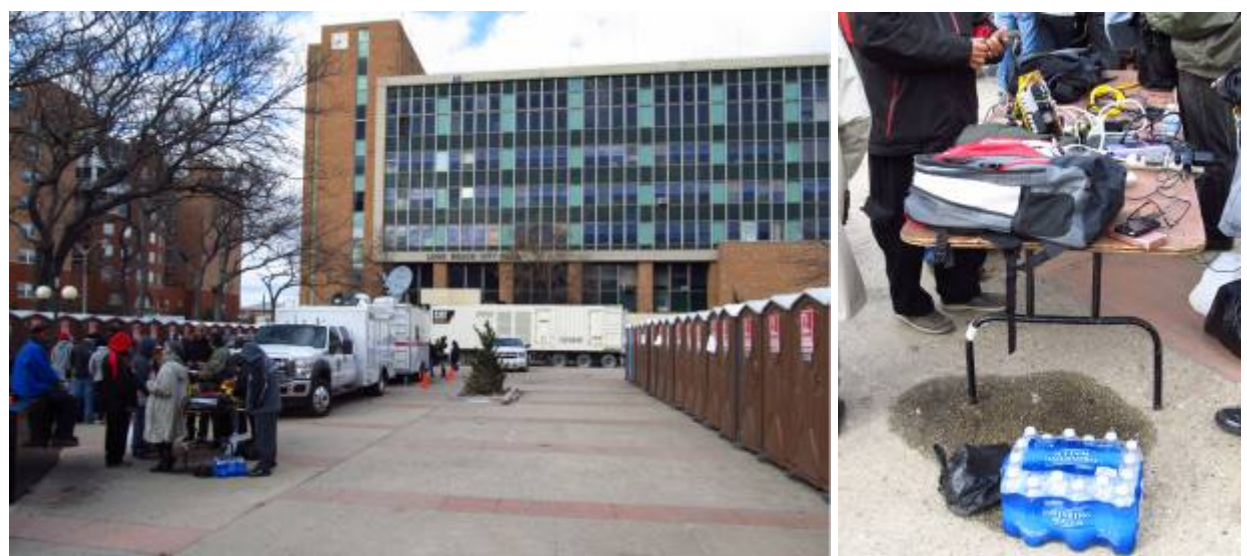
Fig. 26. COLTs and a charging station in Long Beach.