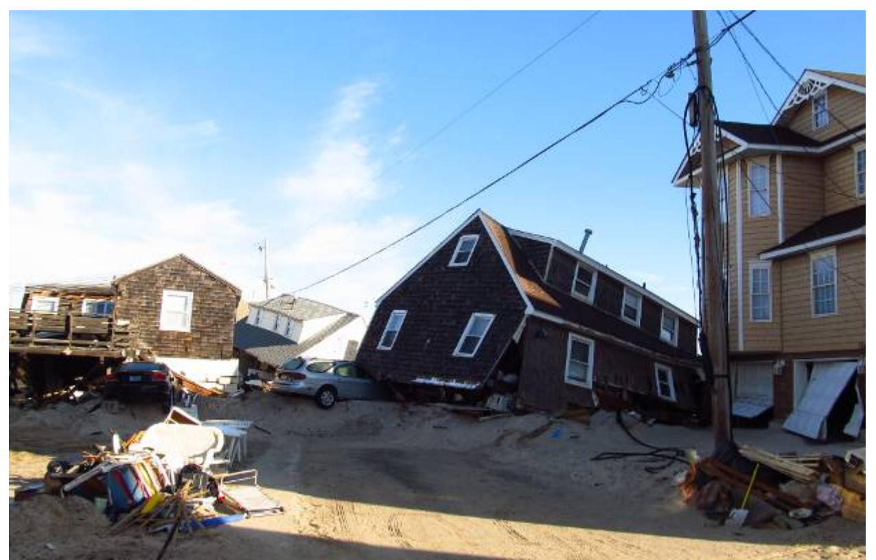
Fig. 36. A severed telecom cable hanging from the pole on the right.